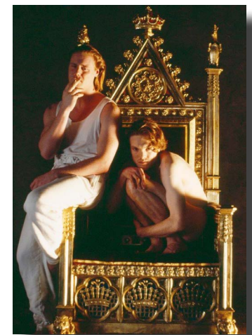
Derek Jarman's Edward II (1991)